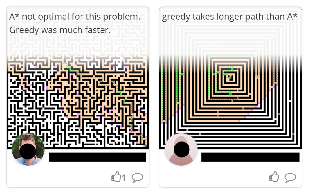
Figure 3: Students sharing mazes which illustrate the relative strengths and weaknesses of Greedy Search and A* Search

The OpenLearning platform provided the design team the opportunity to augment the traditional lecture approach, and to provide opportunities for more engaging and collaborative learning experiences. The design team used the ICAP framework (Chi & Wylie, 2014) to provide a guideline for the activities we adapted for the flipped tutorial model. The ICAP hypothesis posits that "engagement behaviors can be categorized and differentiated into one of four modes: Interactive, Constructive, Active, and Passive. The ICAP hypothesis predicts that as students become more engaged with the learning materials, from passive to active to constructive to interactive, their learning will increase" (Wiggins et al., 2017). This has been proven to be effective in engineering education (Menekse et al., 2013), and was central to the development of our maze widget, which in addition to helping students visualize and contextualise path search algorithms, provided opportunities for constructive and interactive learning experiences.