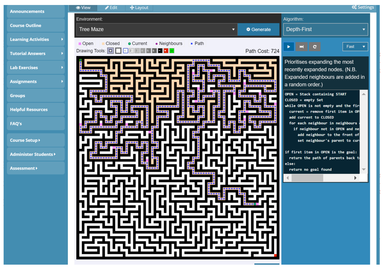
Figure 1: Maze widget simulating a depth-first search on a randomly generated maze

The widget design went through three main iterations. The first conceptualized its use as a visualization tool. Students would first be asked to select a certain style of maze (tree maze, graph maze, concentric tree maze, concentric graph maze, alternating squares or empty) from a drop-down menu, and then press a button to generate a random maze in the specified style (Figure 1). They could then select an algorithm from another drop-down menu and step through the algorithm, or let it play out automatically – with a speed control. This would provide students with immediate reflection on how the algorithms execute within the gridmaze, and an opportunity to compare and contrast the different approaches.